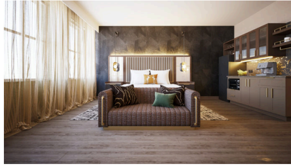
( https://richmondbizsense.com/wp-content/uploads/2026/03/berkeley-hotel-outset-richmond-2026-4-scaled.jpg )